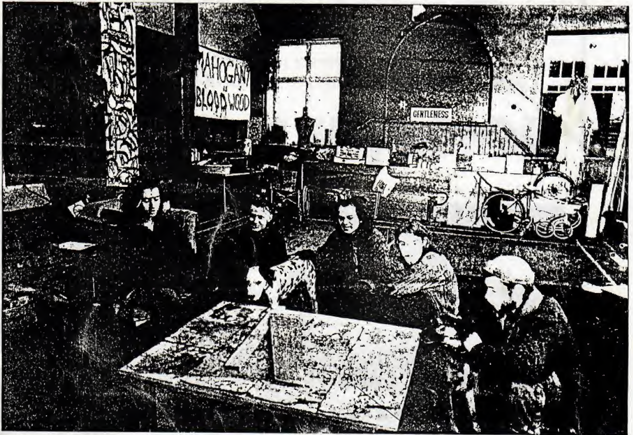
CENTRE FOR THE COMMUNITY: Squatters in the old school hall, beside the memorial hall, where they run an information centre.